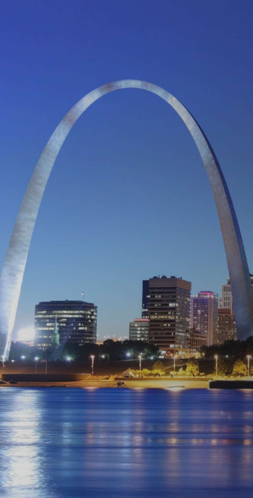
Exhibit Hall Times